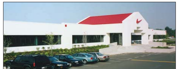
Nike Memphis, Tennessee 710,000 SF