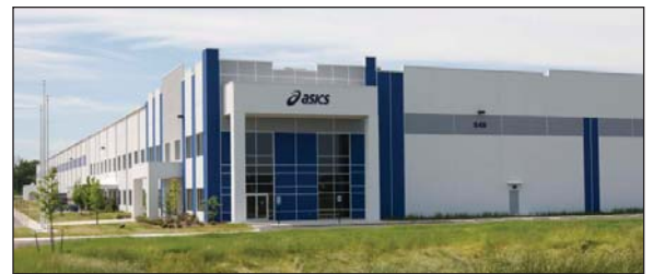
ASICS Byhalia, Mississippi 520,000 SF